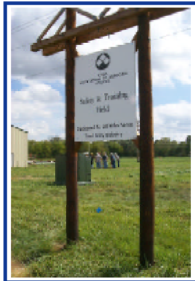
Safe City will be a significant addition to IAMU's highly regarded Safety & Training Field in Ankeny, Iowa.

Plans for Safe City also include an above ground confined space training vault; and open bays that will house pipes and lines to simulate underground installation, repairs, cable pulling and fire control demonstrations.