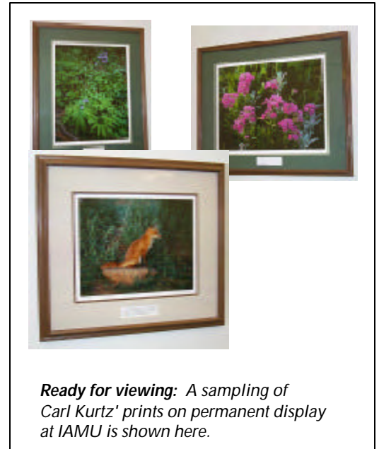
Ready for viewing: A sampling of Carl Kurtz' prints on permanent display at IAMU is shown here.

IAMU's staff and visitors have been enjoying this view of the diversity of Iowa's natural areas, from the sand mounds of Muscatine County, to the rocky canyons along the Iowa River, from prairie remnants to vast woodlands. The photos are installed in the auditorium and atrium areas. Please take time to stop and experience "Iowa's Wild Places" the next time you're at the IAMU Training & Office Complex.