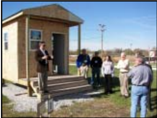
IAMU's Safe City was shown to board and committee members during an open house in the fall of 2007. Development will continue in 2008.