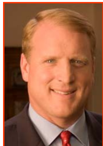
Governor Chet Culver (invited)