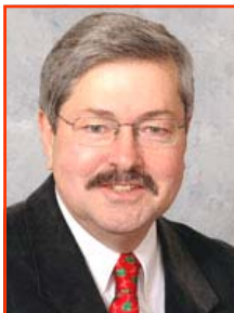
Former Governor Terry Branstad

Registration coming soon to www.iamu.org