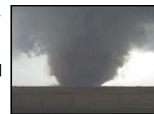
"Riding The Storm Out" is the theme for the conference's final day.

As always, associate members will be on hand at the conference with displays (at both the host hotel and IAMU) and hospitality suites. Register for the Annual Conference and see the full agenda here .