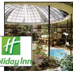
A favorite among IAMU members, the Holiday Inn Des Moines Airport will again be the event's host hotel.