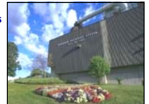
The Chantland plant in Ames has been a leader in resource management for many years.

◆ The City of Ames’ Arnold O. Chantland Resource Recovery Plant has been recognized by the American Society of Mechanical Engineers (ASME) for achievement in environmental and safety performance.