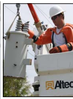
The Beginning Pole Climbing Workshop (far left photos) provided various skill exercises at the Overhead Workshop, while general field activities allowed attendees to practice many hands-on techniques to provide top-level service to their utilities and customers.