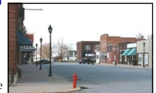
The Public Library and business district in Stratford, an IAMU Whole Town Energy Audit member.