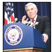
Sen. Richard Lugar

◆ Saying "Energy and climate legislation must reflect the economic realities facing Americans today," Sen. Richard Lugar (R – Ind.), teaming with co-sponsor Lindsey Graham (R – S.C.), has introduced a climate and energy bill (S. 3464) that focuses on energy efficiency, vehicle fuel standards and promotion of clean energy resources. The lawmakers say they want to find common ground on the issue with other Senators, such as Democrat John Kerry and Independent Joe Lieberman, who already released their own version of a climate bill.