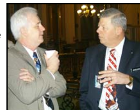
IAMU members will again have the chance to meet legislators at a State Capitol rally February 10.