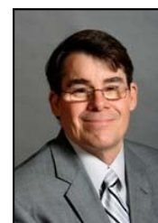
Senate Majority Leader Michael Gronstal

The session will focus on monetary issues, with legislators working to reduce the budget by a minimum of $500 million. Another key concern of the session will be government reorganization. A legislative interim committee and the Governor's office have made reorganization recommendations that will be included in legislation. Municipal utilities will be working to pass legislation to "fine tune" joint financing language that was passed in 2001. The legislature's web site includes live audio of sessions, along with other features. Access it here .