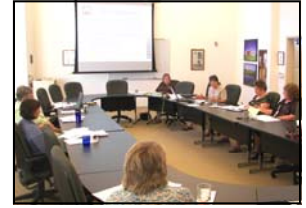
Whole Town Energy Audit participants share information at a meeting this week.

An interim meeting for half of the participants was held at IAMU August 16; the remaining cities will gather August 20. The meetings include shared reviews and reports, group discussion and forms to be submitted to the Office of Energy Independence.