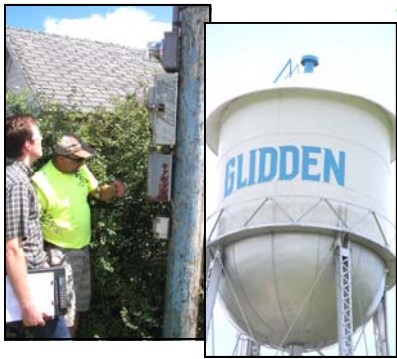
Recent Whole Town Energy Audits and related events have taken IAMU staff to (top to bottom) Auburn, Breda and Glidden.