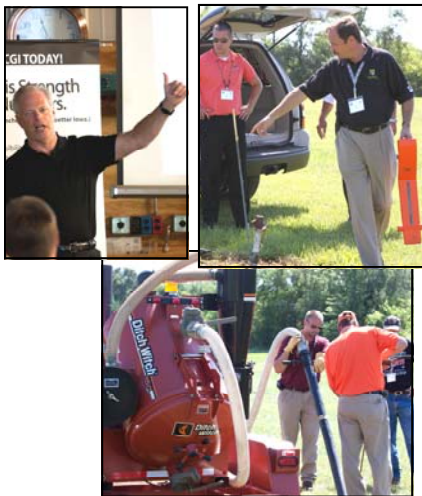
IAMU's Training & Office Complex recently hosted the Common Ground Iowa (CGI) Excavation Safety Summit, an event which brought together many utility and other industry professionals for presentations and demonstrations touting best practices for safety in the field.