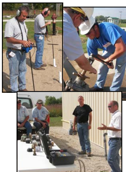
IAMU's water training facilities were busy recently with the fall edition of the Water Distribution and Leak Detection Workshops.

* When emailing to add or remove a subscriber, please include full name and affiliation