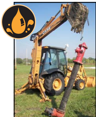
A thank you is extended to Titan Machinery of Des Moines for supplying a Case backhoe for use with the Water Distribution Workshop.