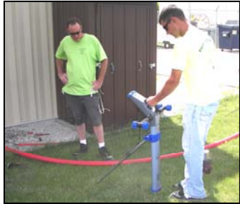
The Villisca Municipal Power Plant provided personnel and equipment to IAMU in boring for a two-inch electric line conduit that will help power the association's new wind turbine. The current 1.5 KW turbine will soon be replaced with a 5KW model mounted on the same tower.