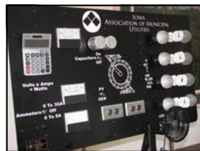
Joel Logan, IAMU's Energy Services Engineer, tries out the new Pedal Power display. At right is a close-up of the display panel, which includes lighting and other items that can be powered by pedaling an attached bicycle.

IAMU member Greenfield Municipal Utilities plans to use the display as the RAGBRAI cycling event passes through that community later this month. Interested participants can easily attach their own bicycles to the interactive attraction.