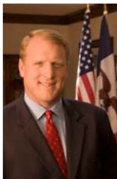
Gov. Culver will speak Feb. 10

◆ Governor Chet Culver will join the IAMU Winter Meeting February 10 in a special luncheon address. The luncheon is scheduled to begin at noon, with the Governor planning to speak at approximately 12:40 p.m.