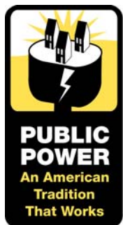
Public Power Week October 5-11, 2008

The course will be offered November 4 in Sioux City; November 5 in Cedar Falls; and November 6 in Cedar Rapids. Register online at www.iowahomelandsecurity.org .