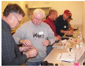
Participants in one of IAMU's recent Water Operator Lab Workshops get their share of hands-on experience. Both one-day workshops were filled to capacity.